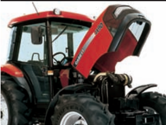
Re-fuelling at ground level is safe and easy.