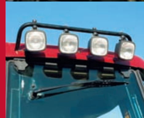
DEALER INSTALLED ACCESSORIES